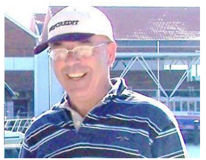
By Edwin Flynn