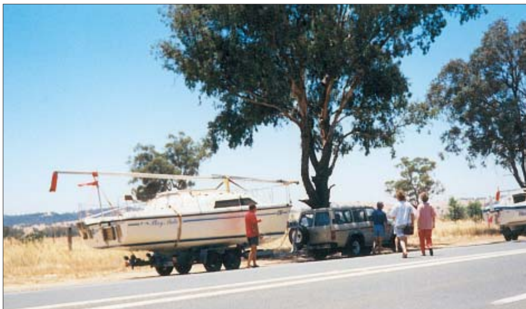
A flag must be attached to protruding masts

Masts protruding from the rear of a trailer can be difficult to see. A warning flag is required at the end of a protruding mast. The warning flag must be brightly colored red or yellow, or red and yellow, at least 450 millimetres long and at least 450 millimetres wide.