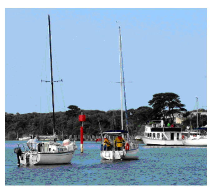
Soul Maid under tow with motor difficulties

Our arrival at Ocean Grange was well timed as a few boats left as we arrived. Eventually everyone had a spot on the jetty, although there was one motorboat that had left and thought leaving his fenders on the jetty would reserve his spot. We explained to him when he came back that boats cannot reserve spots, but it all ended well and he found a new position on the jetty.