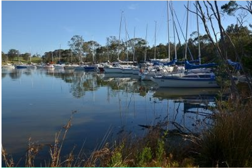
BTYC Beach - aka Duck Arm