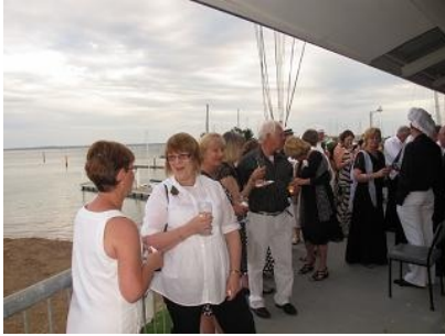
Enjoying a drinks at Hastings Yacht Club