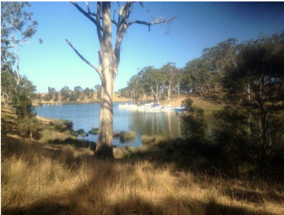
Another nice photo of Baysiders at Picnic Arm