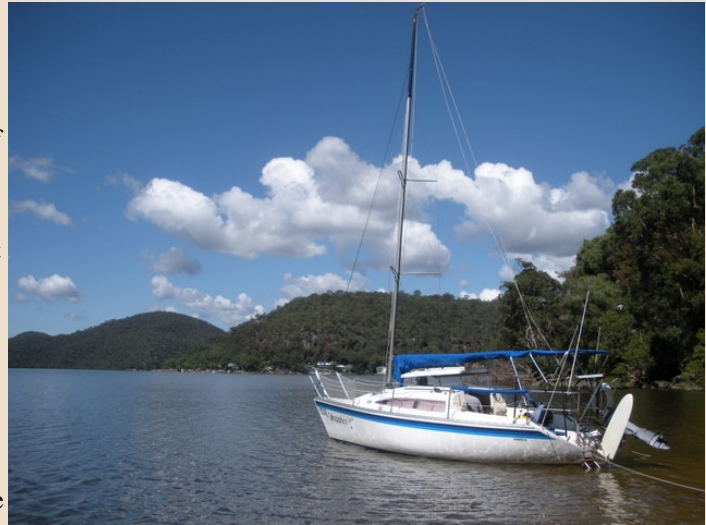
Photo: Magnificent Scenery.